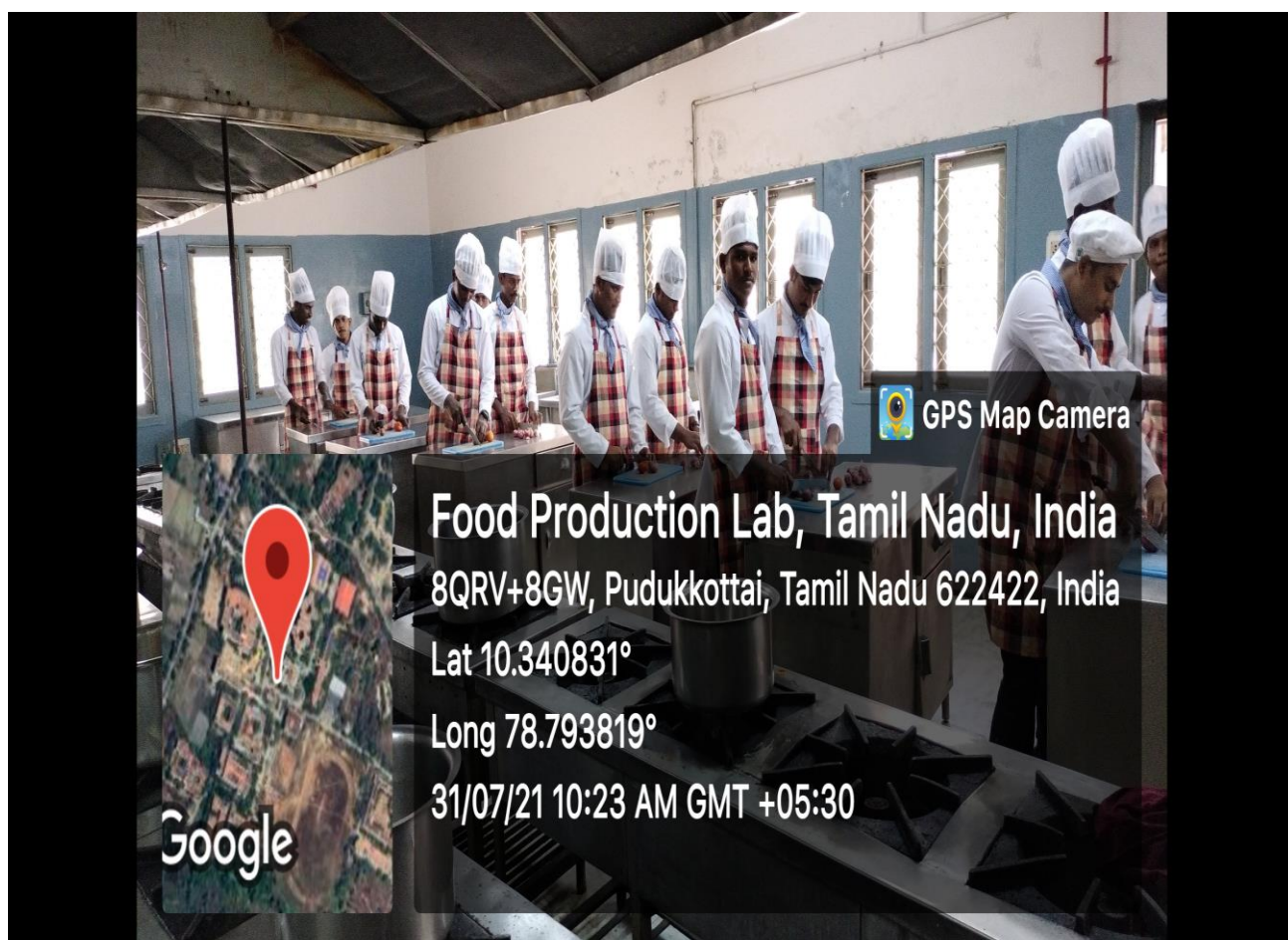
Students Preparing Dishes

The Department conducted practical classes as per the time table. Students gather knowledge about the Culinary skills, Food and Beverage service, Housekeeping and Front office management.